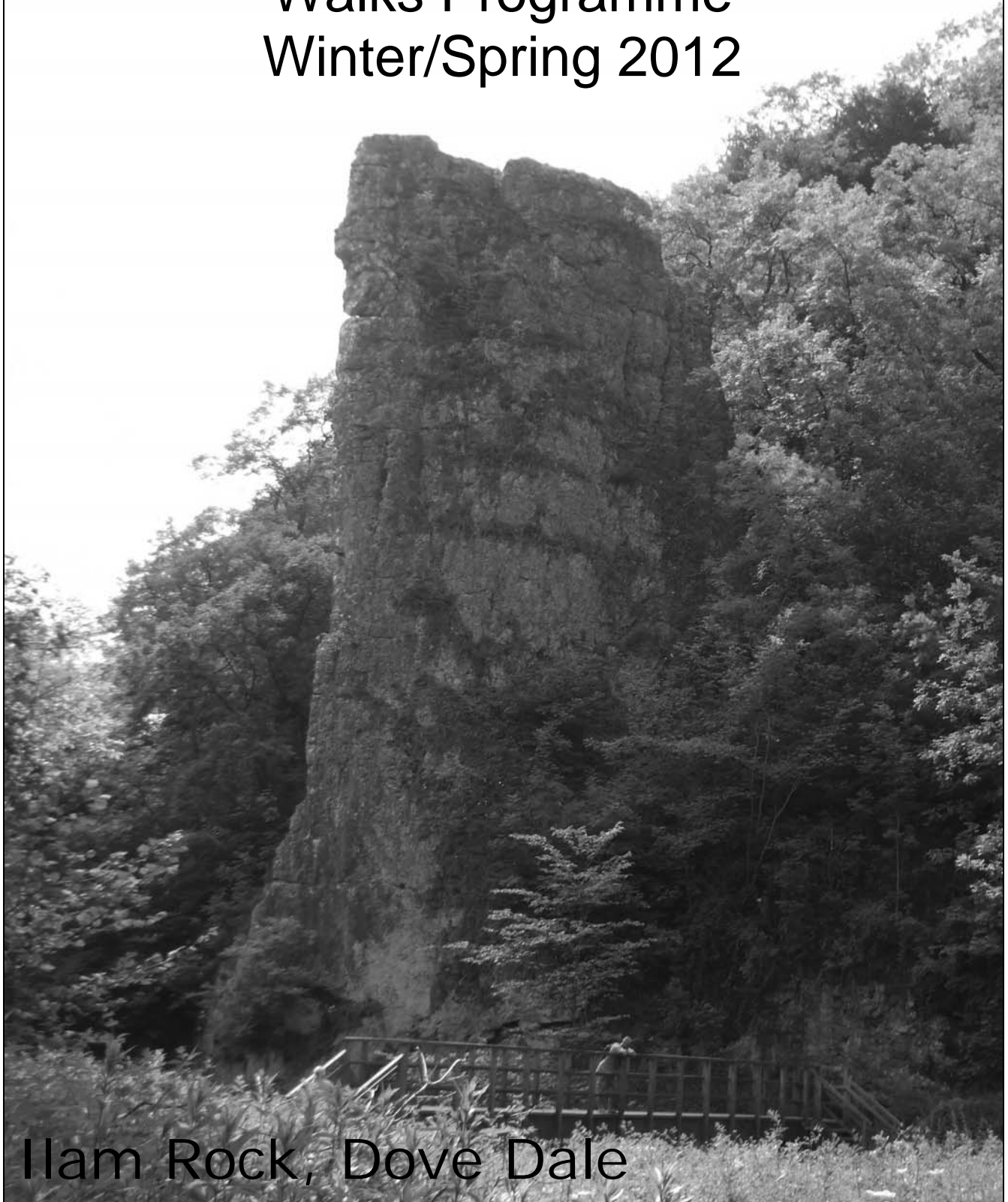
Ilam Rock, Dove Dale